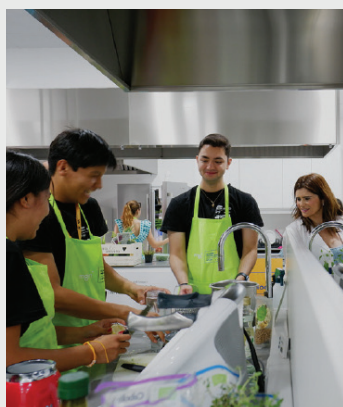
—○ KITCHEN LAB