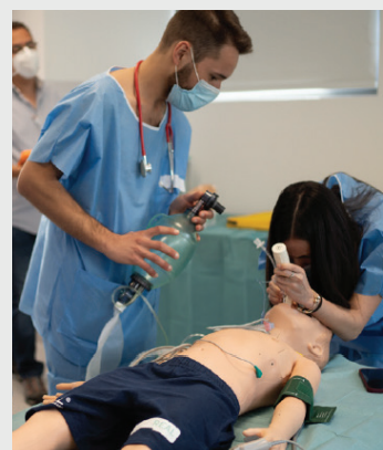
—○ CLINICAL SIMULATION CENTER