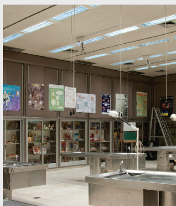
—○ ANATOMICAL THEATER